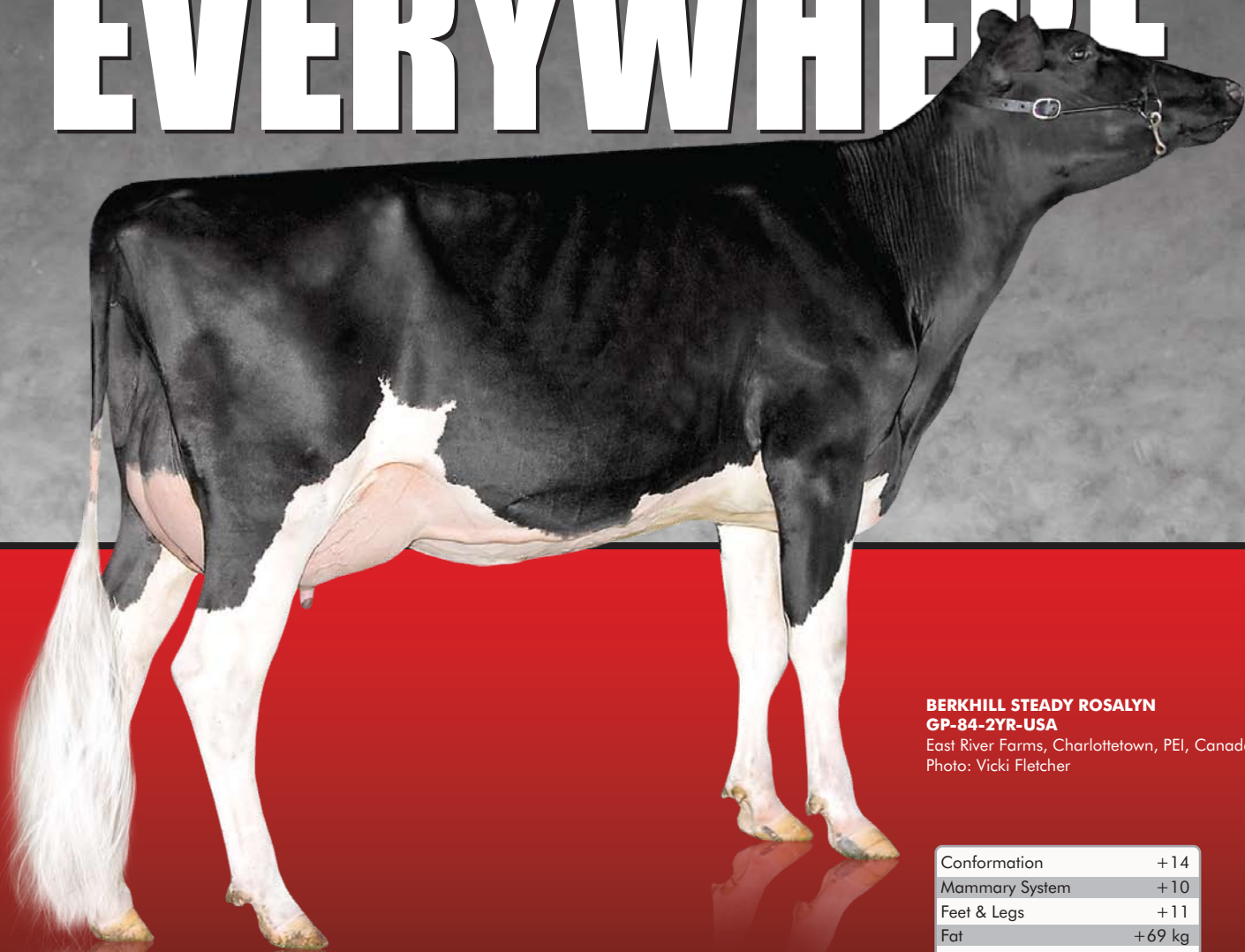
BERKHILL STEADY ROSALYN GP-84-2YR-USA

East River Farms, Charlottetown, PEI, Canada